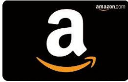
$10 Amazon Gift Card