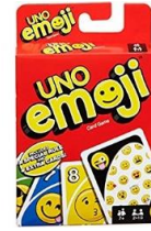
Uno Emoji Card Game