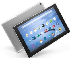
Amazon Fire HD 10