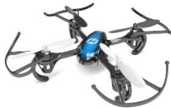
Remote Control Drone