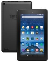
Amazon Fire 7 Tablet