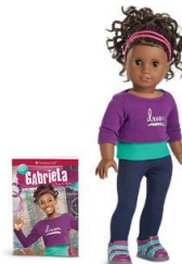
American Girl Doll